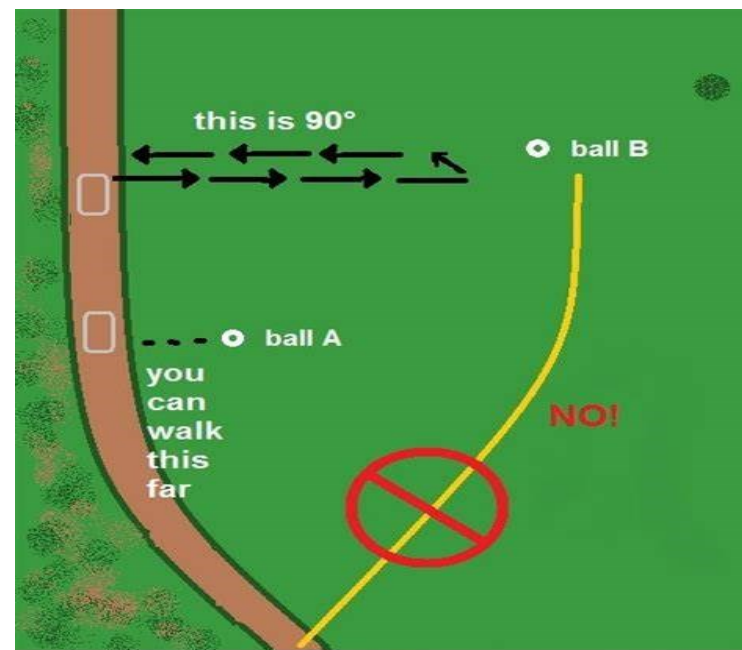
The 90 degree RULE is not a suggestion.

The cost each week to play is 40.00 through October which will include 9 holes with a cart and prizes. For weekly signups, please call 772-770-5000 ex 2 or email bnagy@ircgov.com .